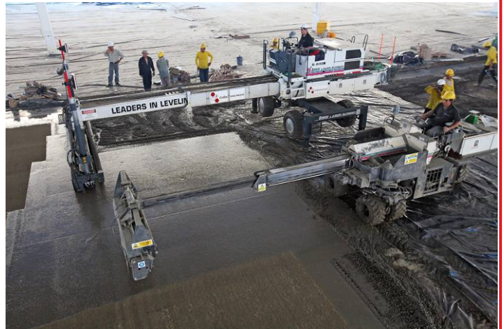
Construction of a Steel Fibre only SOP for Tesco Thailand 2008

The CoGri Group are a consortium of international floor solution specialists. With over 20 years of global experience in Construction, Upgrading and Design of Industrial Concrete floors, the CoGri Group are able to offer a complete package solution for the construction, enhancement and repair of warehouse & industrial floors.