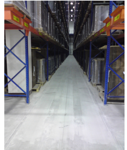
ITTM: 3-Wheel Truck Grinding

The Laser Grinder® machine was mobilised for the project directly from Australia after our project in