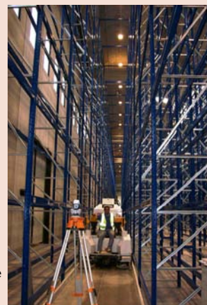
Nick Mawtus on the Laser Grinder®

Once CG commenced work on the outstanding 17 aisles, 2 wheel tracks 380mm wide were ground in each and every aisle. To keep to the project schedule, 2 Laser Grinders® were used. One Laser Grinder® was used for